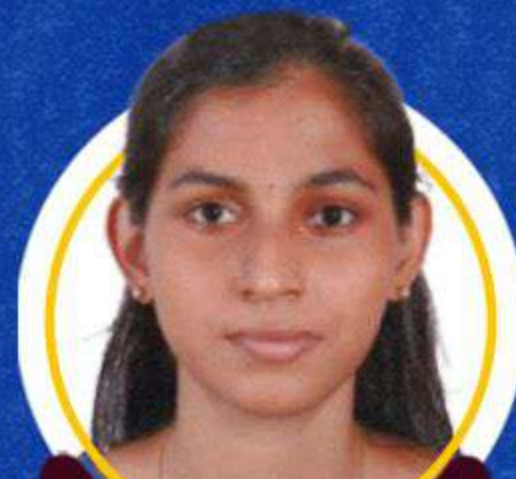
Achsah S AIR(ES) - 792