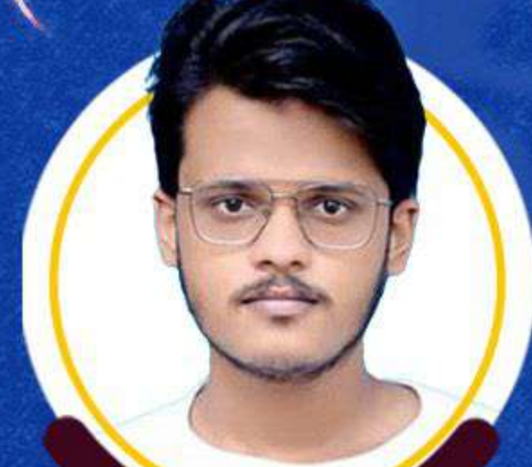
Mirsab N AIR(ES) - 912