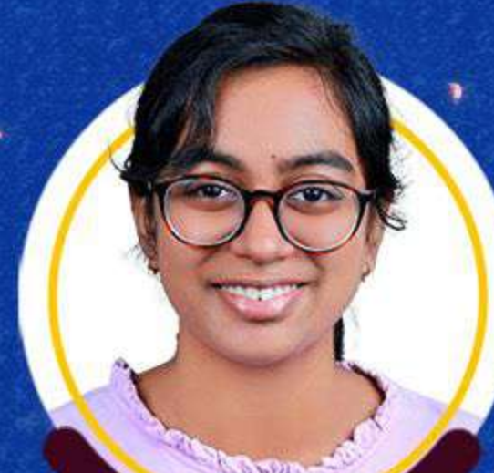
Helga R S AIR(ES) - 891